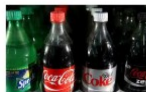
Bottles or cans of soft drink