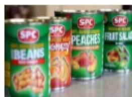
Non-perishable cans of food or packets of food